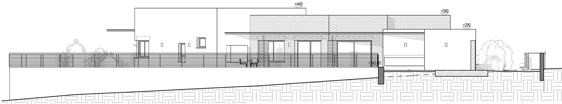
North East elevation - (1: 50)